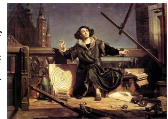
Copernicus – Conversation with God

Prior to 1543 it was a commonly accepted truth that the earth was the center of the universe. Then Nicolaus Copernicus enunciated an astronomical principle which revolutionized the study of science. Copernicus discovered that this earth was not the center of the universe, nor did the sun revolve around the earth. This single discovery, completely reversed the order of scientific thinking.